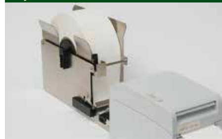
*FP-32L with Roll paper unit