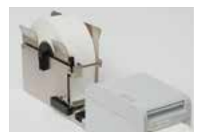
<FP-32L with roll paper unit>

"Roll Paper Unit"(option) can help to print for roll paper with big diameter up to 200mmΦ.