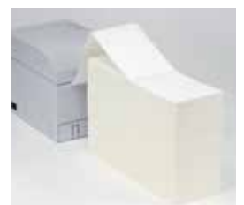
<FP-32L with fanfold paper>

FP-32L can print large amount of papers in various situations smoothly. [Example: Logistics or Manufacturing, etc.]